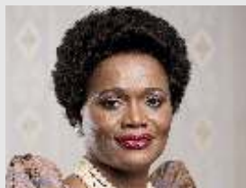
HRH QUEEN SYLVIA NAGGINDA Queen Buganda Kingdom & Founder Nnabagereka Development Foundation